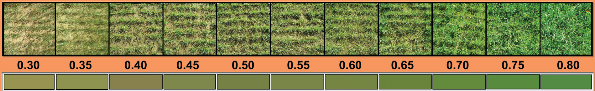
Images collected at growth stage Feekes 5. This is when leaf sheaths lengthen, normally occurs in Oklahoma around February