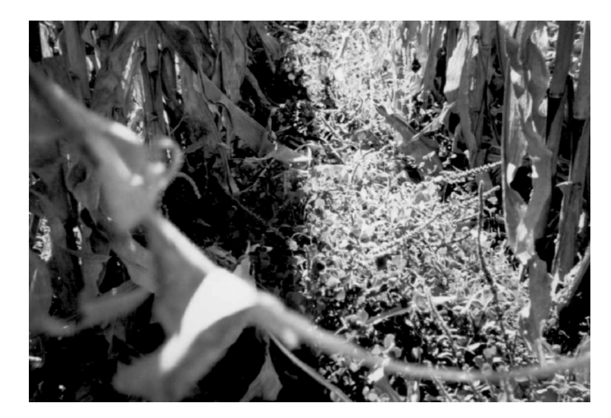
Figure 3. Interseeded legumes between rows of corn.