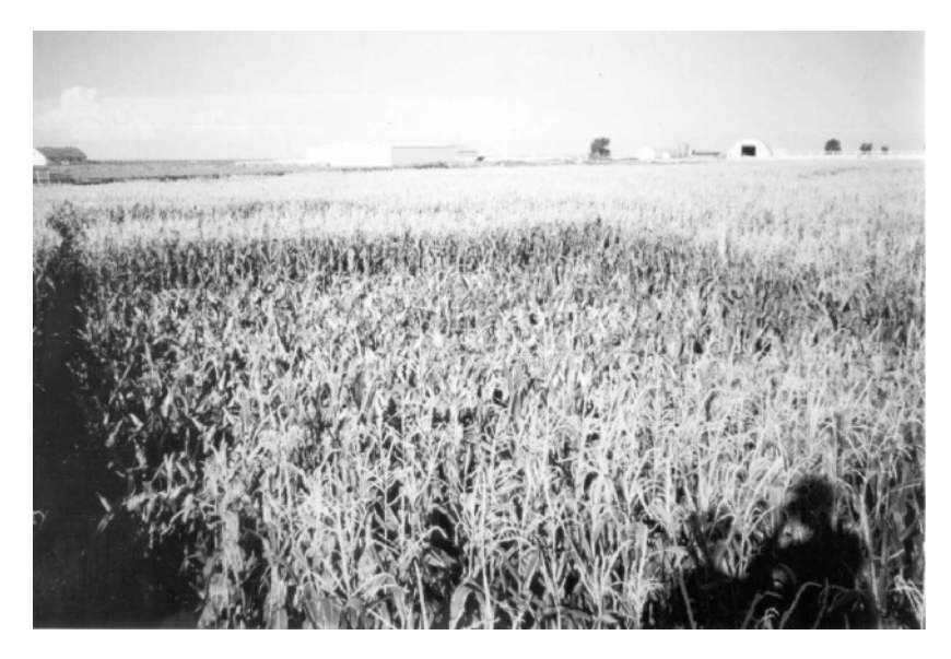
Figure 2. Canopy reduction imposed above the ear by means of a machete.