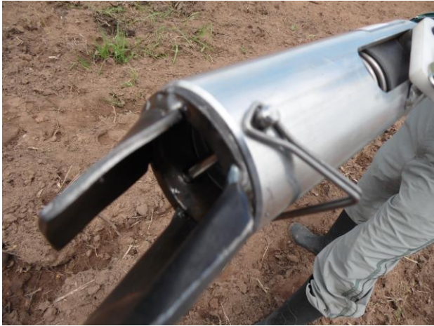
The dark metal tip (on the left) had the perforations not in front of the housing (on the right) perforation. It was necessary to adjust the two in order to allow inserting the pin.