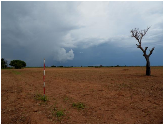
Location of the farm, and view of the land. The terrain is sandy and flat, there is no soil erosion

1 example of the 2014 prototype hand planter was received at RTMK end of November for testing. Trial was done beginning of December after receiving the metal tip missing part. Location: maïs field from Nkinke, Kashobwe, Katanga. The trial was done under actual farm conditions of mechanization and use of labour.