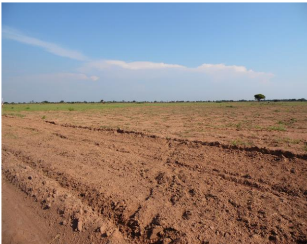
What we do in practice: 1 md is dropping the seed followed by 1 md to cover the seed with his feed or 2mds/1.000m line, 4 lines/day.