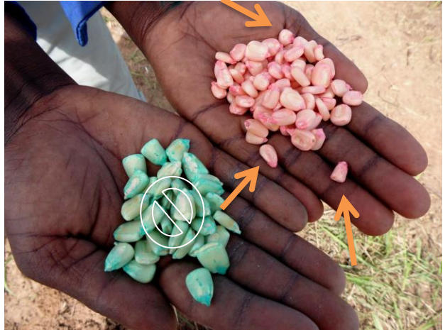
Green seeds (in front) used for this 2014 planting season: the size of the seed is too big for the Greenseeder Hand Planter . The OSU Hand Planter is not dropping big size seeds. Pink seeds (in the back) used for last 2013 planting season: only small size seeds are dropped by the hand planter.