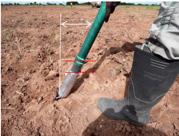
Movement 1: introduce the hand planter with an inclination into the soil. The depth is even due the end tip.