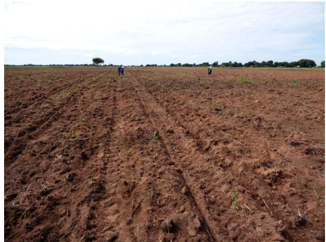
What we do in practise: a furrow is opened with help of a maïs planter (the planter is not dropping seeds).