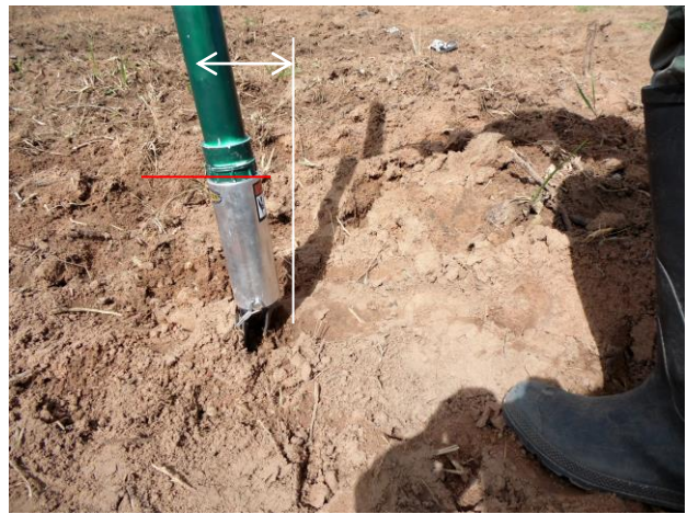
Movement 2: push the hand planter in front of you while pressing and releasing the spring (which movement will drop the seed).