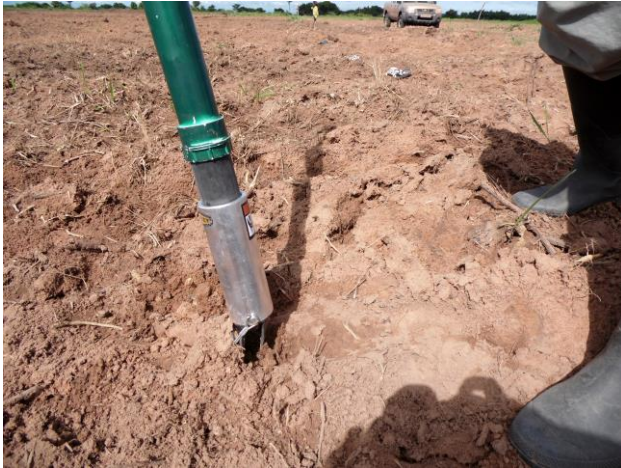
Movement 3: pull the hand planter out of the soil. This movement is supposed to cover the seed