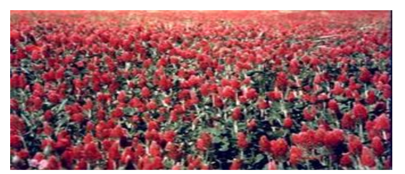
Crimson clover is a legume cover crop that fixes N from the atmosphere and after termination can release that N to the following crop.