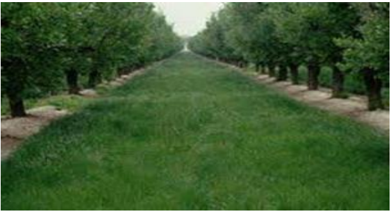
Cover crops are extremely effective at suppressing weeds and resisting compaction in large open areas such as the rows in this orchard.