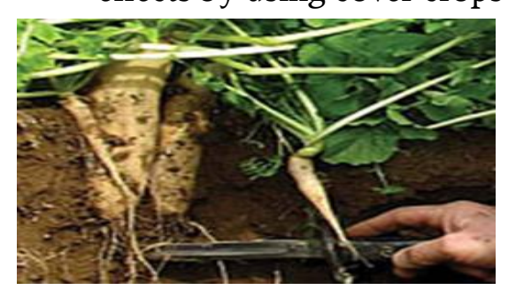
Left: Forage radish is effective at alleviating compaction.

• Easily prevent these potentially devastating effects by using cover crops